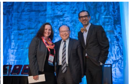
CCS Awards Ceremony, Vancouver 2017