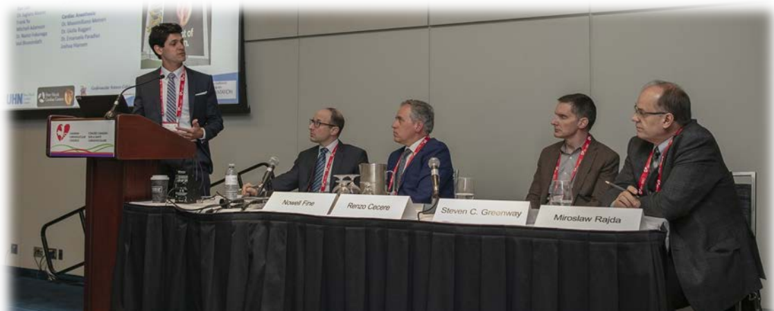
2018 CHFS/CCTN Research Competition