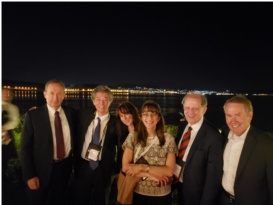
ESC-HFA Meeting Athens - May 2019